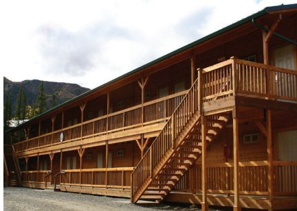
Denali Grizzly Bear Resort