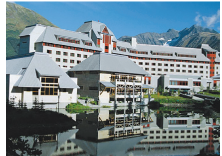
Hotel Alyeska resort