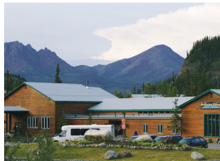
Denali Park Village