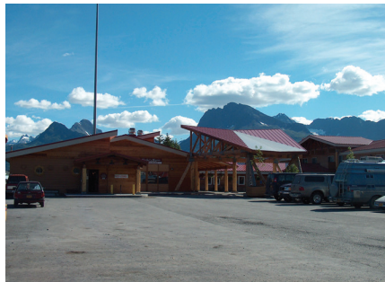
Best Western Harbor Inn