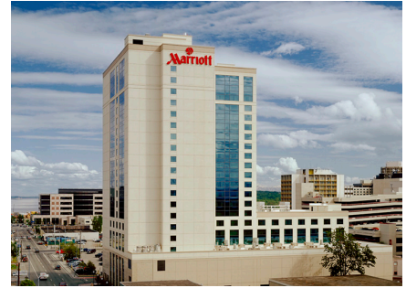
Marriott Anchorage Hotel