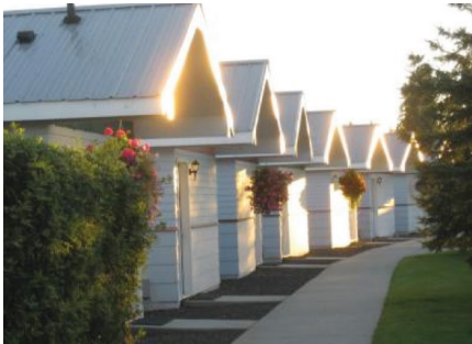
River's Edge Resort