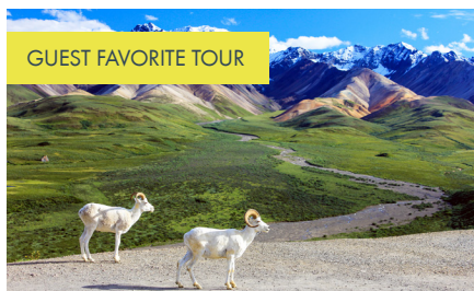
GUEST FAVORITE TOUR