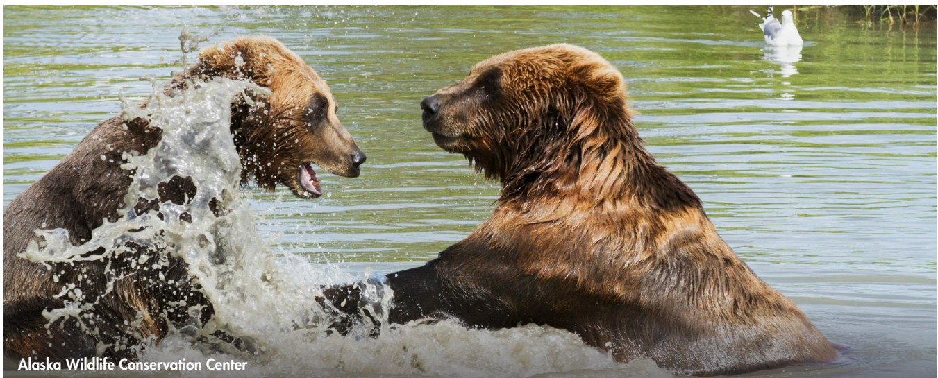
Alaska Wildlife Conservation Center