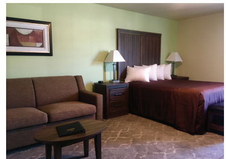
Aspen Suites Hotel Homer

*Hotels are assigned at Norwegian's discretion. We are unable to accept requests for specific hotels. Hotels are guaranteed at 30 days prior to the start of the tour. Norwegian Cruise Line reserves the right to substitute hotels of equal or greater quality.