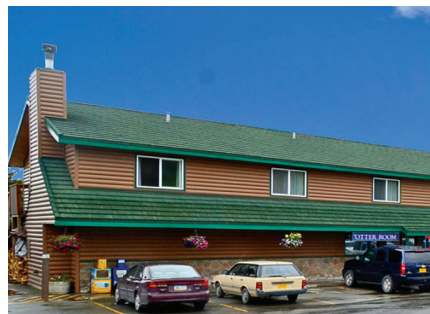
Best Western Bidarka