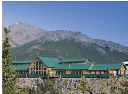
Grande Denali Lodge