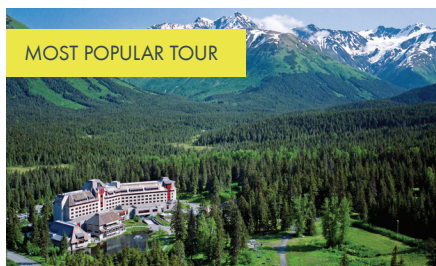
MOST POPULAR TOUR