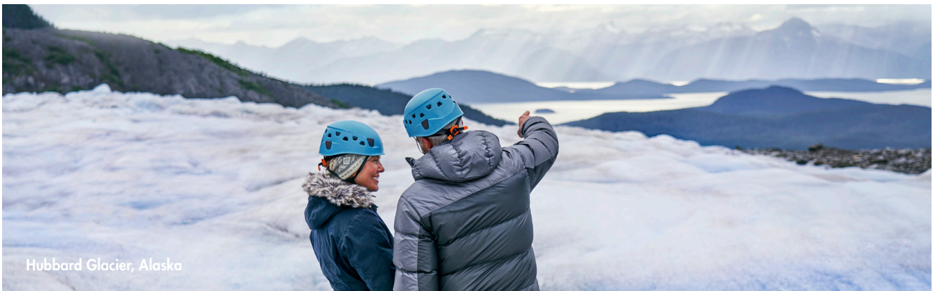
Hubbard Glacier, Alaska