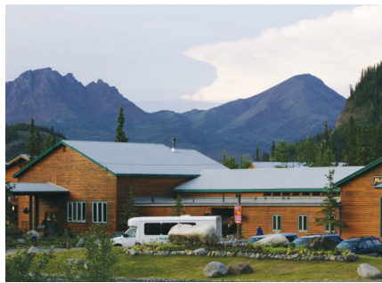
Denali Park Village