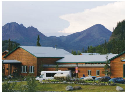
Denali Park Village