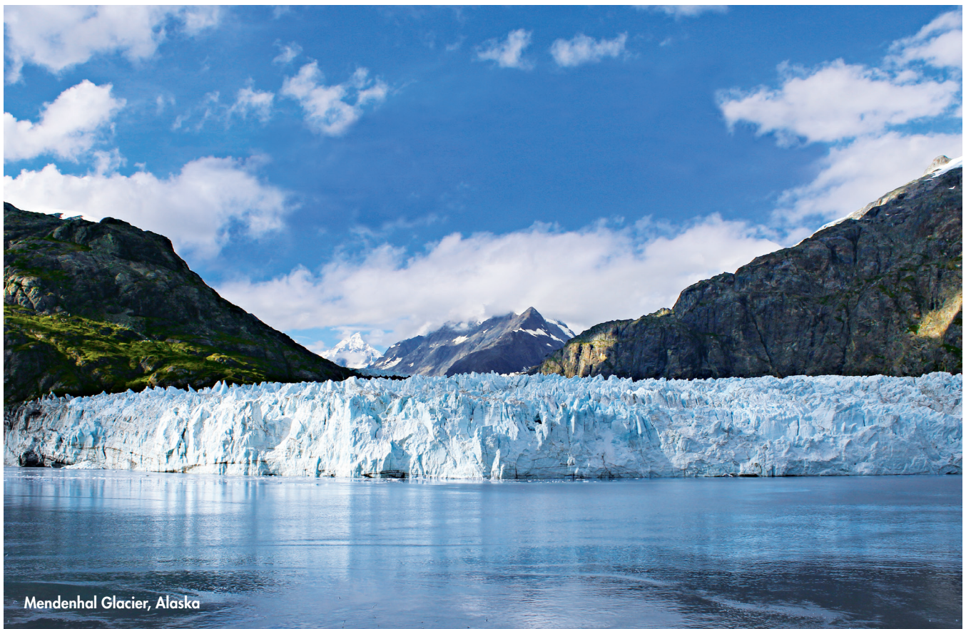
Mendenhal Glacier, Alaska

*Hotels are assigned at Norwegian's discretion. We are unable to accept requests for specific hotels. Hotels are guaranteed at 30 days prior to the start of the tour. Norwegian Cruise Line reserves the right to substitute hotels of equal or greater quality.