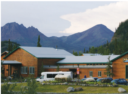
Denali Park village